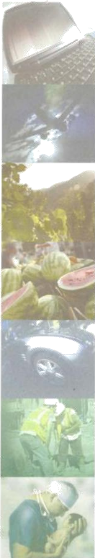
Cert IU bis 0408